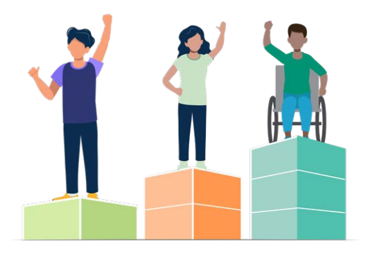
Goal 1: Instill equity as a foundation of Emergency Management