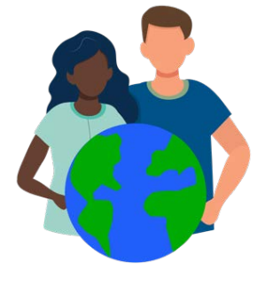
Goal 2: Lead Whole of Community in Climate Resilience